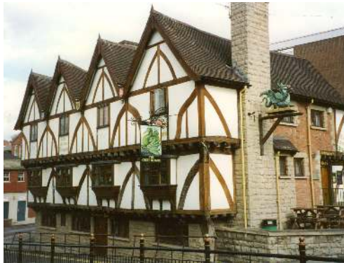
The Green Dragon Inn